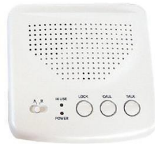
Item # ats4530 Ships in 2 business days